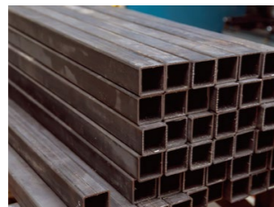
Building Materials Industry