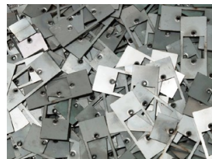
Sheet metal Industry