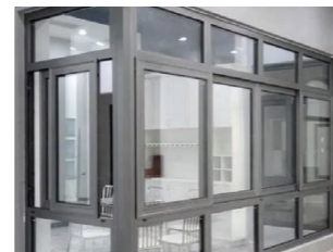
Door & Window Industry