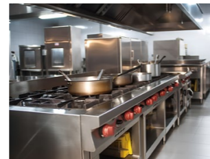
Kitchen & Bathroom Industry